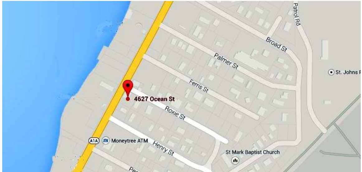
4627 Ocean Street

generally do now. Modern conveniences such as bathrooms and electricity were added later. Electric power reached Mayport in 1936. 6