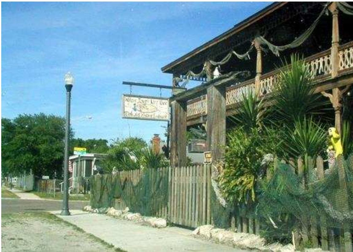
The King House, 2000