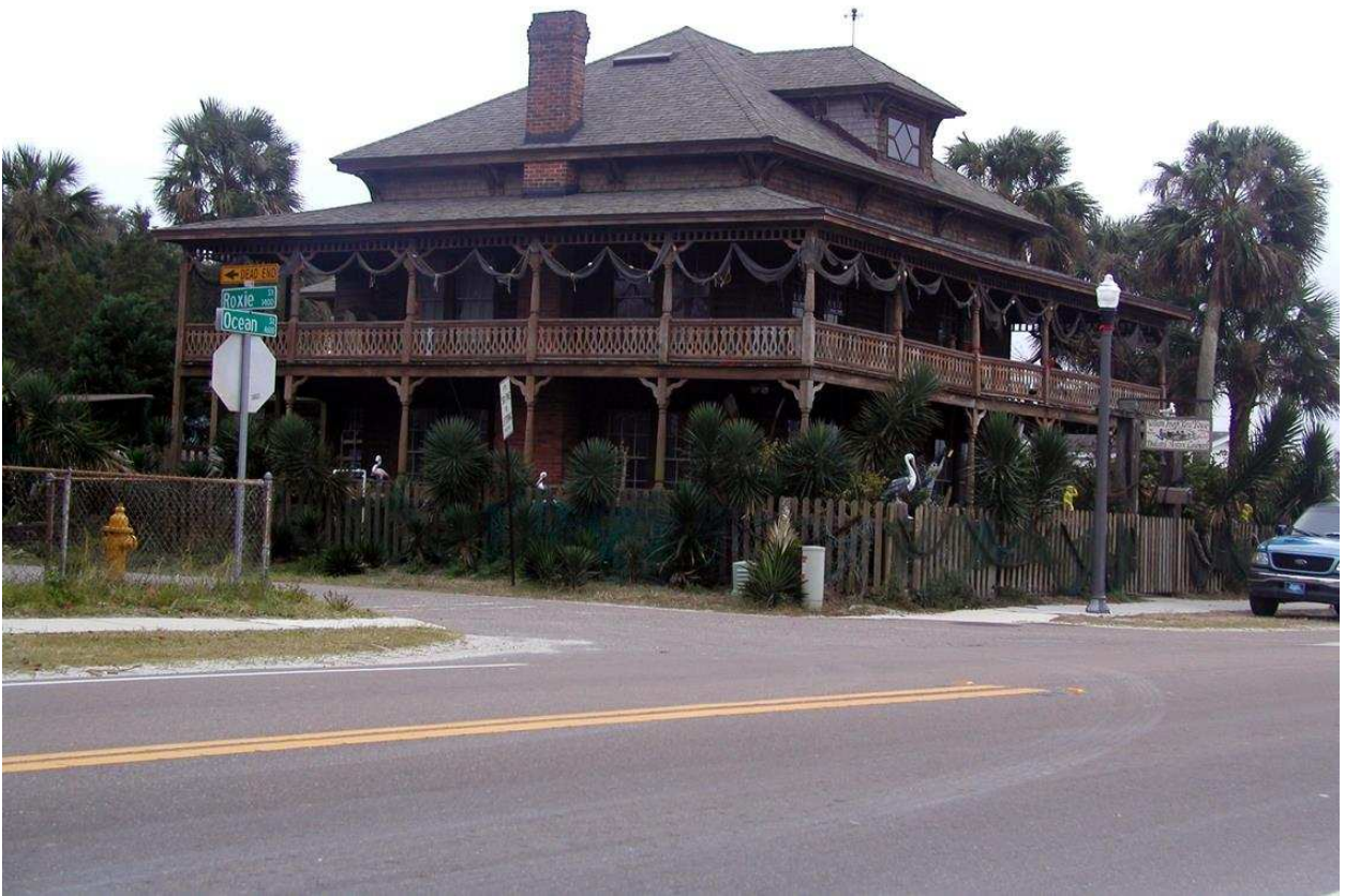
King House, 2001