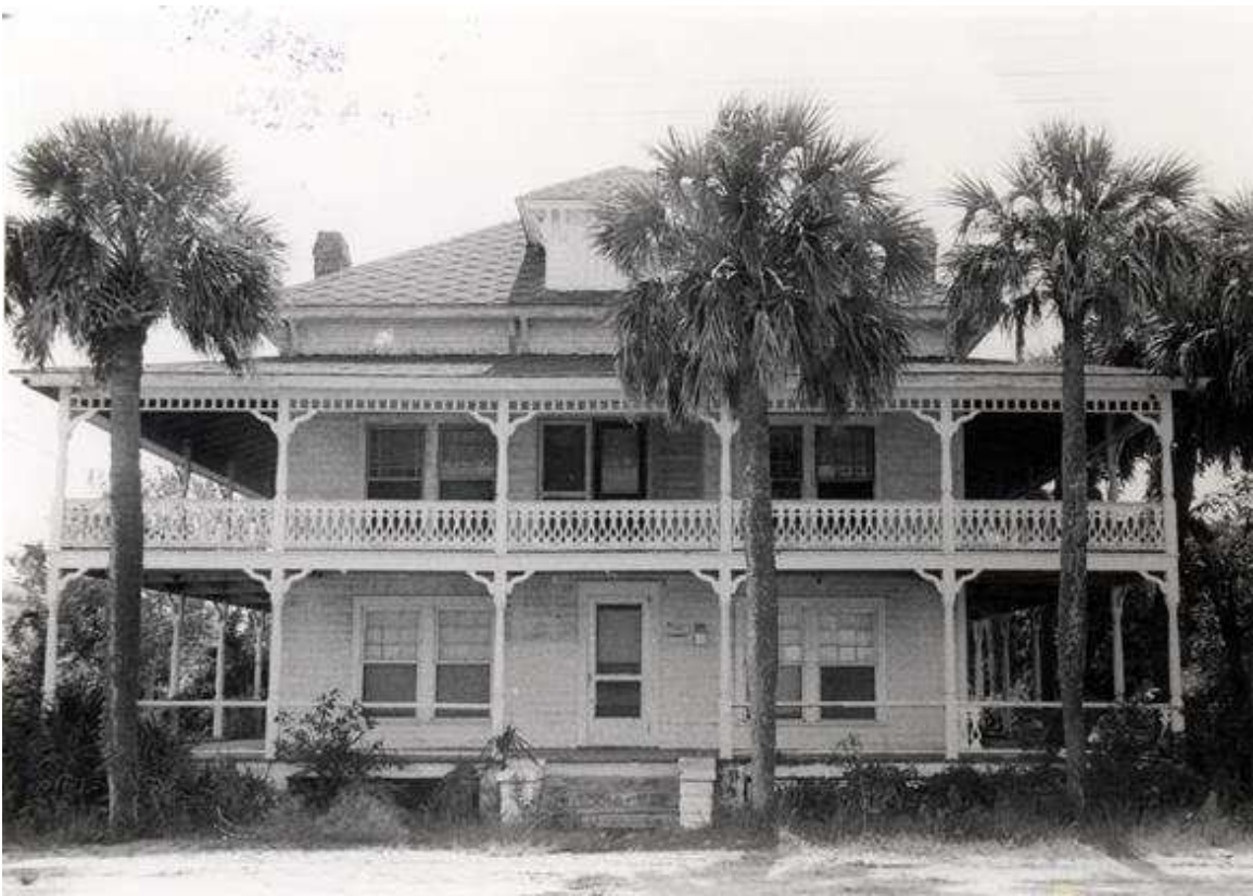
King House, pre-1982